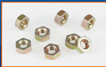
JIS Single Nuts