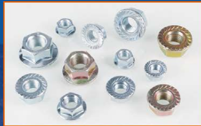
Hex Flange Nuts