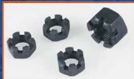
Slotted Hex Nuts