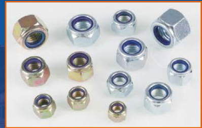
Nylon Lock Nuts