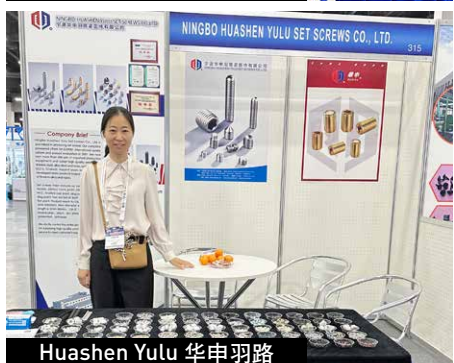
Huashen Yulu 华申羽路