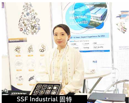
SSF Industrial 固特