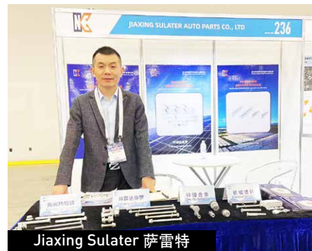
Jixing Sulater 萨雷特