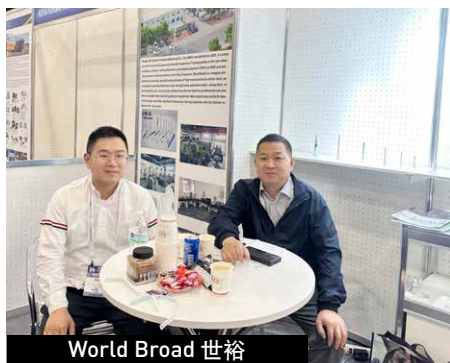
World Broad 世裕