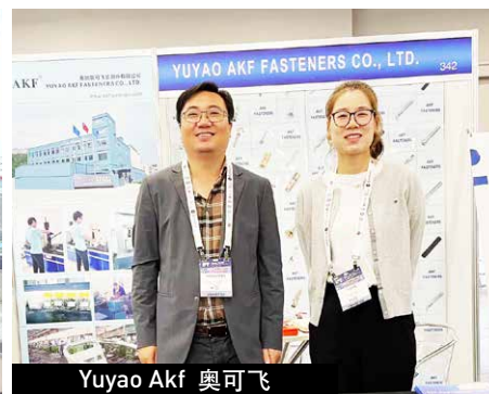
Yuyao Akf 奥可飞