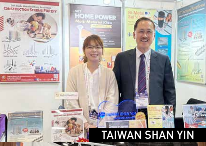
TAIWAN SHAN YIN