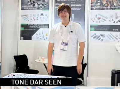
TONE DAR SEEN