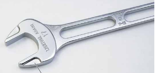
Head shape utilizing lightweighting and strength

Manufacturer: ASAHI METAL INDUSTRY CO., LTD.