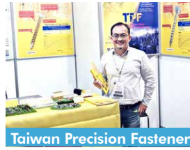
Taiwan Precision Fastener